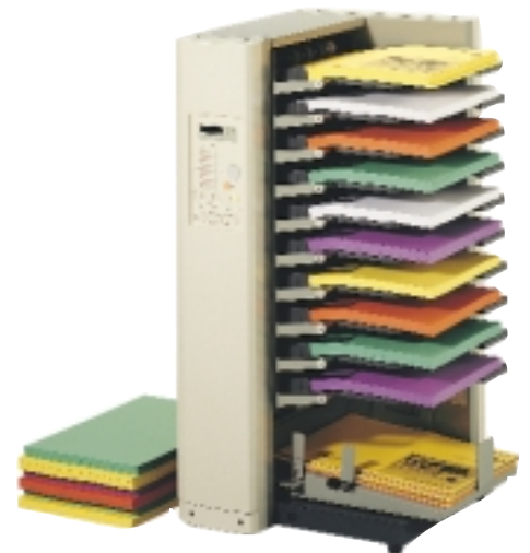
Up to 3,300 sets an hour: Nagel ZN-10

Rapid format conversion: the sliding table for the Nagel ZN-10