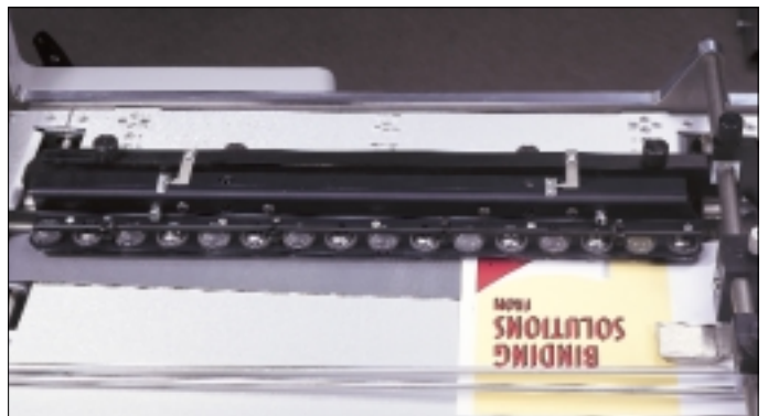
Side lay register table ensures that the paper is correctly aligned before feeding into the rollers.