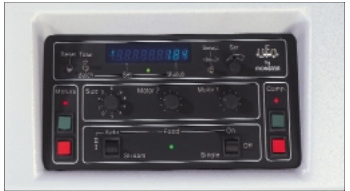
Control panel contains the standard counting/batching facility and all others controls in one ergonomical sited position.