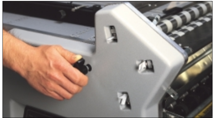
Fold roller pressure settings give completely accurate pressure on each fold roller and no marking.