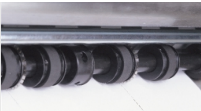
UFO perforating/scoring unit is standard equipment on the UFO 1 and an option on UFO 2/2B.