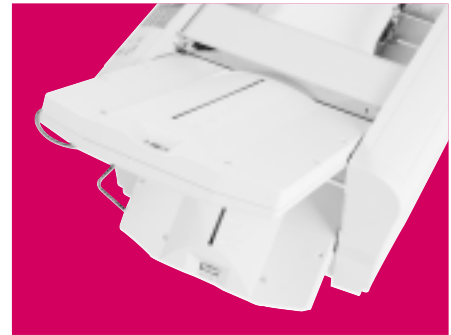
Enclosed fold tables provide quiet operation.