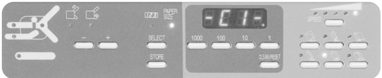
Clearly arranged fingertip controls and lighted display make operation fast and simple.