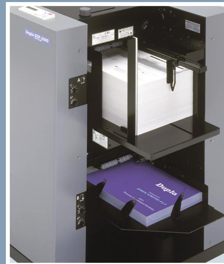
Sheet-Feed • 4-Side Trim • Crease • Stitch • Fold • Trim