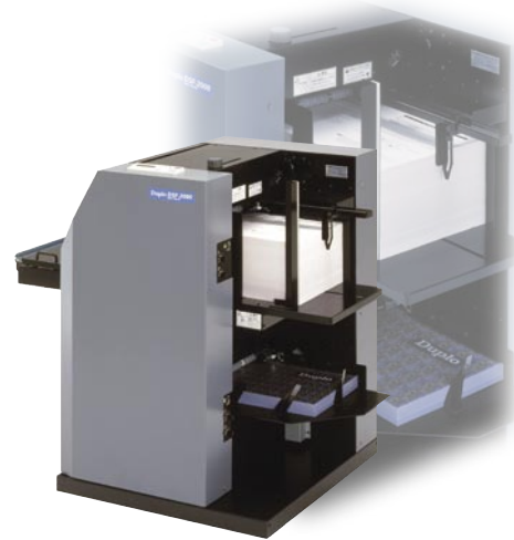
DSF-2000 Document Sheet Feeder